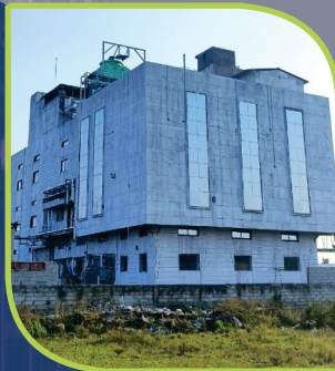
Actual Plant Pictures